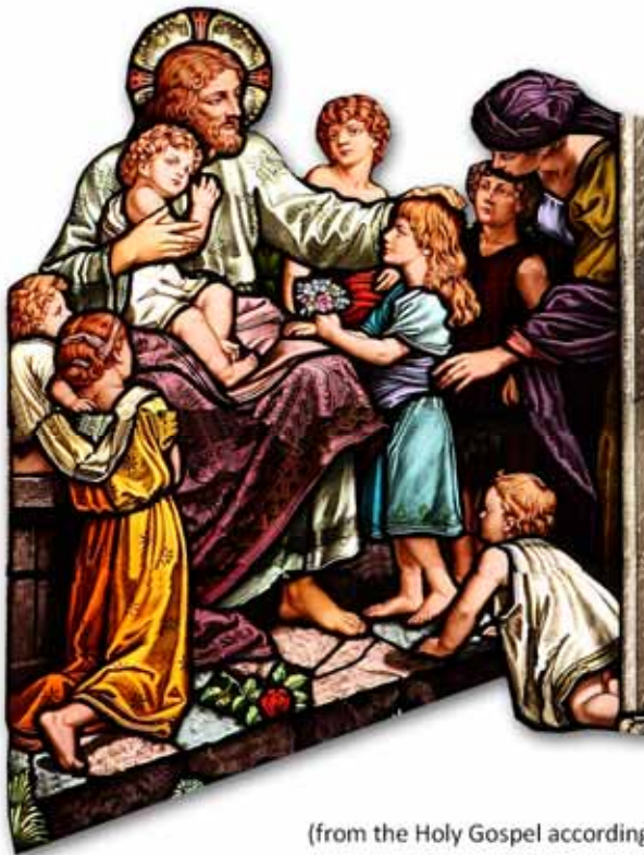
(from the Holy Gospel according to Mark 10:2-16)