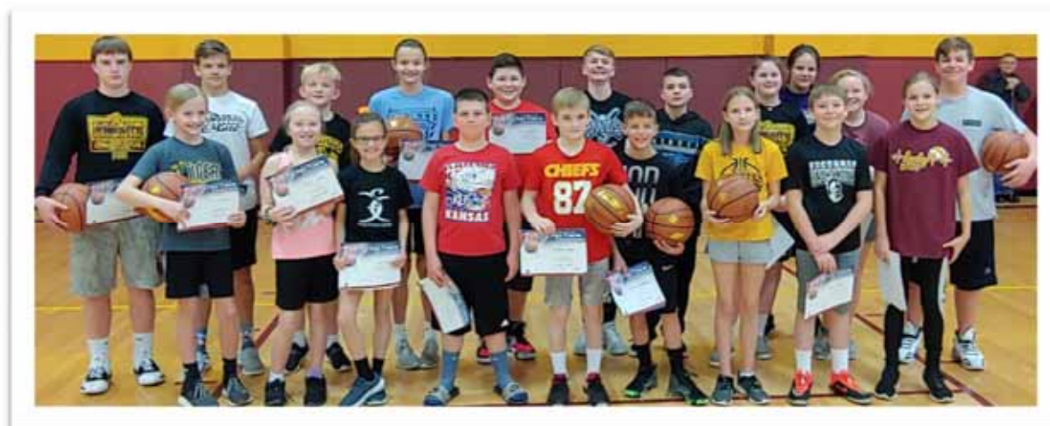
Pictured at Left: Participants in the local Knights of Columbus Free Throw Competition held at Victoria High School Gymnasium on Sunday, January 26.

Each of these winners can compete in the regional competition to be held on February 16 th at the Tipton Community Center, Tipton, Kansas, with an eye toward moving on to the state and international levels.