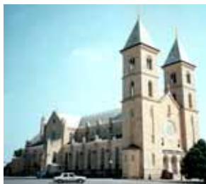
Basilica of St. Fidelis Church

Thank you to the individuals and businesses who lend their support by volunteering or giving monetary donations and by their generosity make this Easter Egg Hunt possible.