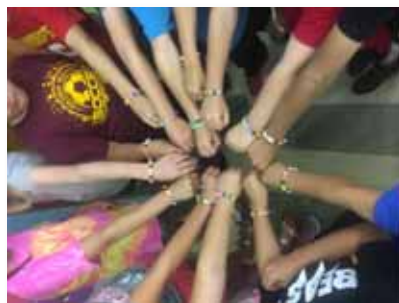
Grades 2 & 3— 10 Commandment Bracelets at the Arts & Crafts Station