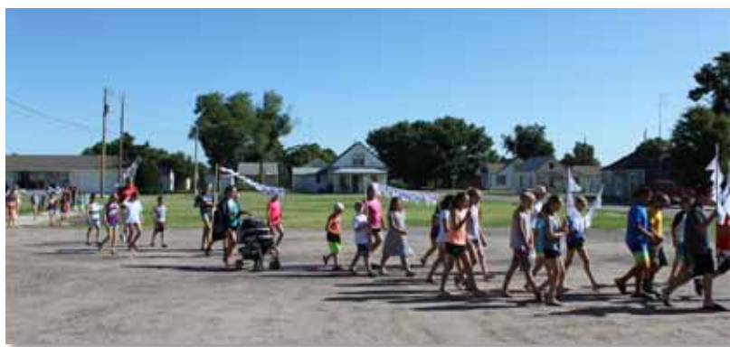
As pictured above—the kids partook in a Rosary prayer procession using the banners they designed on Day 1.