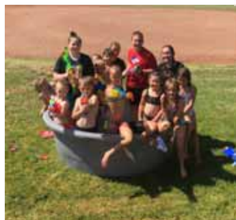
Thank you Victoria Lumber for loaning the stock tanks for Day 5's water games!