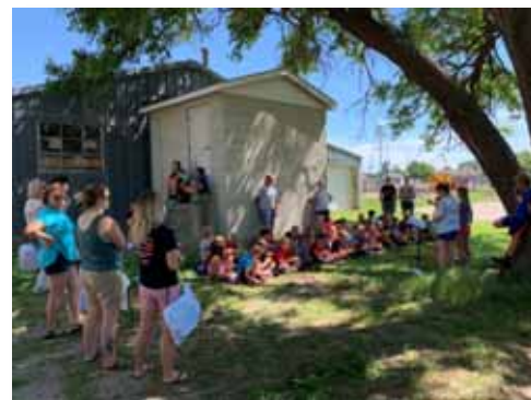
Outdoor closing assembly on Day 2— demonstration on prudence: the ability to do the right thing