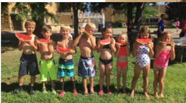
Grades K & 1 enjoying their watermelon on Day 5