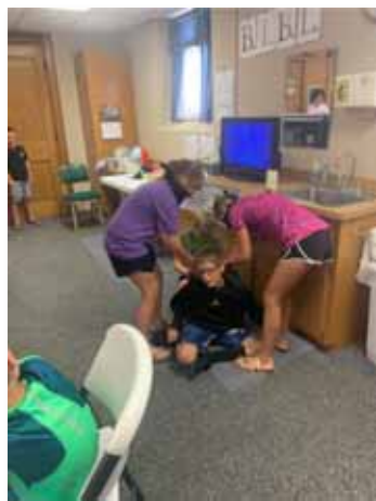
2nd & 3rd grade class at the Faith Station performing a skit.