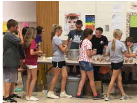
Grades 4 & 5 grab snacks at the Snack Station. We had phenomenal help from adults and high school aged youth! Thank you ALL! ☺