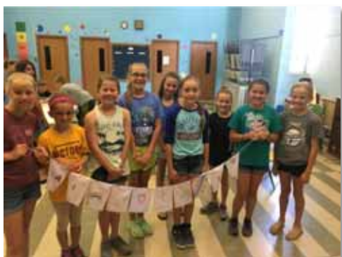
4th & 5th grade girls at the Arts & Crafts Station with their Prayer Banner (used on Day 5 during the Rosary procession)

"If He asks much of you, it is because He knows you can give much." St. John Paul II