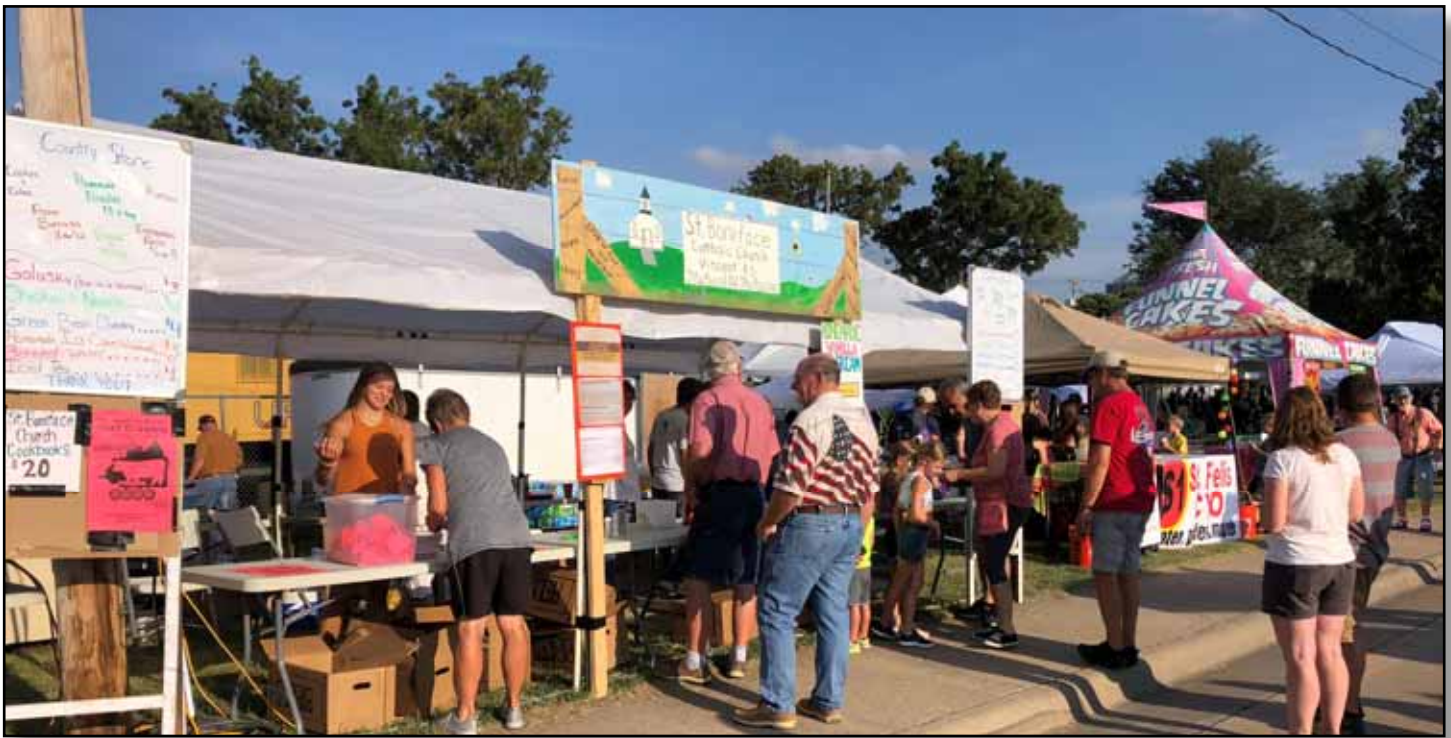
St. Boniface parishioners sell raffle tickets and serve customers in line at the Herzogfest booth.