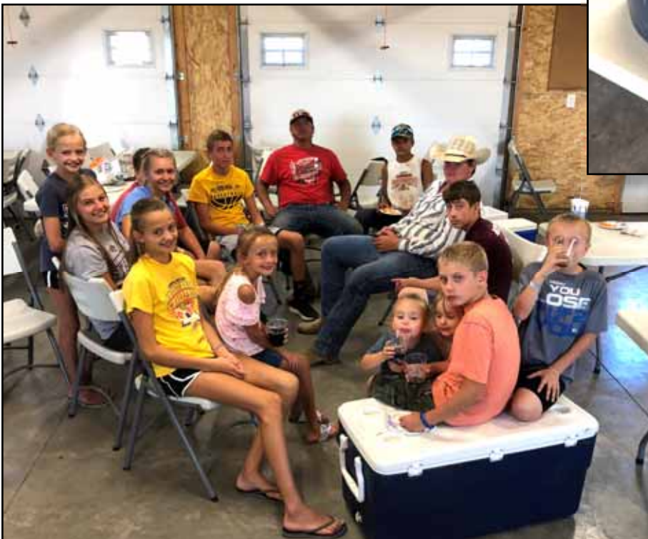
LEFT: After spending nearly four hours making ice cream, St. Boniface youth gather in "a circle of togetherness" and discuss the fun times of the day!