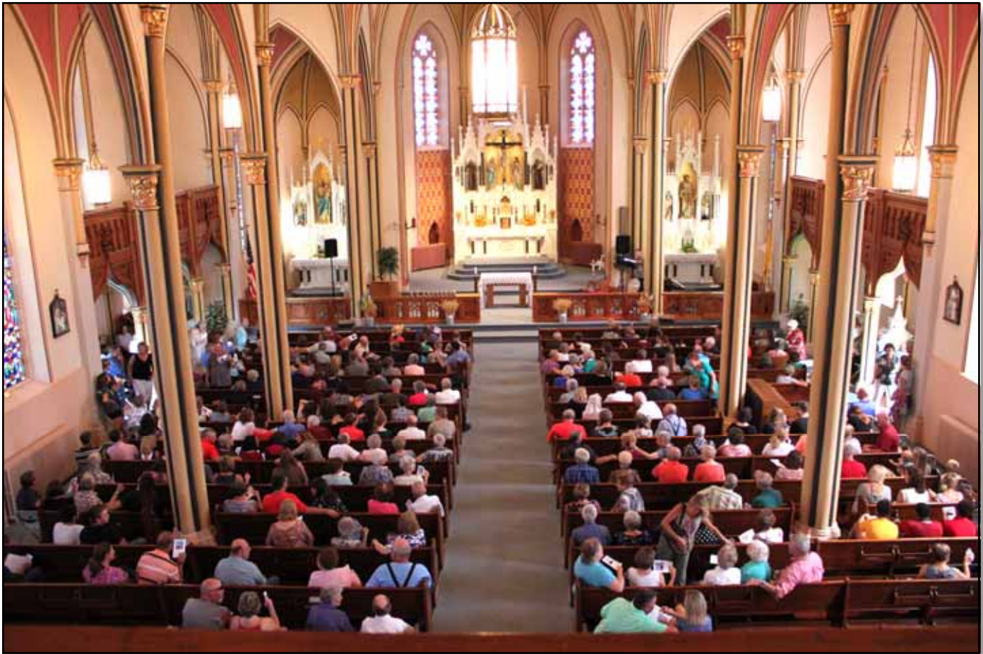
A view of Holy Cross Church from the choir loft before the start of the Mass for the centennial celebration of the dedication of the church. The pews and chairs at the side entrances filled up as the Mass time came closer.

“Mein Haus Ist EinBethHaus” : “My house is a house of prayer.”