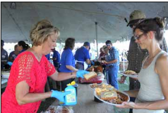
Visitors go through the line to get their roasted pig, baked beans, and scalloped potatoes for supper.

Those wanting to purchase cutting boards, tumblers, and history books can contact any of the board members. Donations towards the upkeep of the church can be sent to Holy Cross Charities, 1313 Steven Drive, Hays, Kansas 67601.