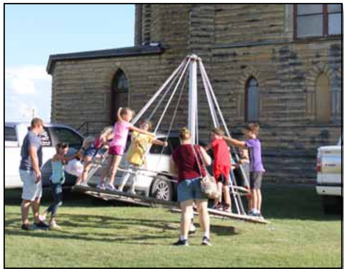
Kids enjoy the merry-go-round on the north side of the church after Mass.

Moneys received from the sale of the memorabilia items as well as the offertory collection, freewill meal donations, the Polaris raffle, and the sale of a reprinted Holy Cross Church history book all go towards the