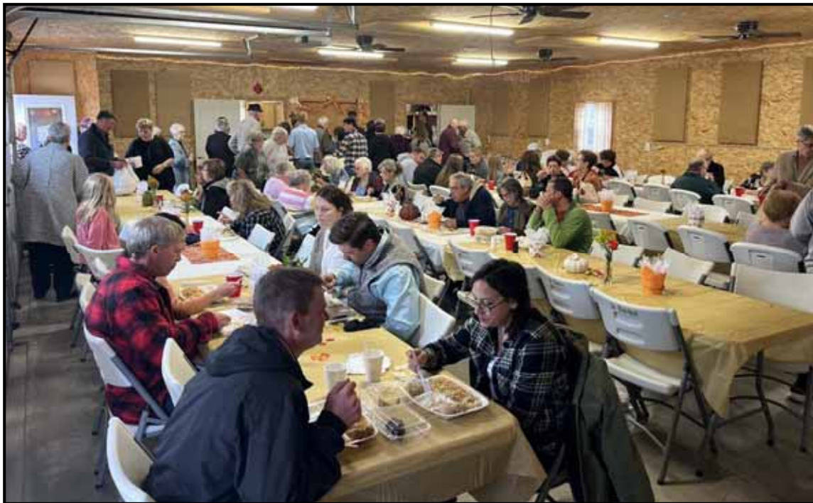
People enjoying the German meal at the St. Boniface parish hall.