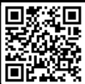
JR. CYO Camp