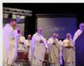
MASS WITH THE BISHOPS OF KANSAS