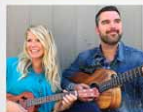
MUSIC BY ALL THINGS I AM