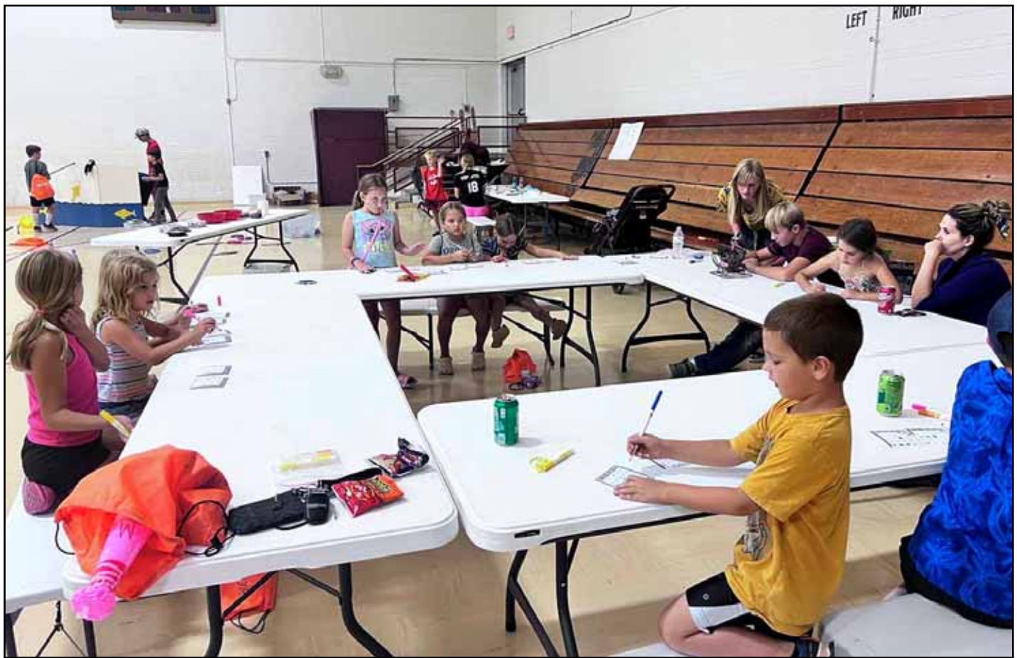
Bingo was part of the Kid's Games in the Victoria Elementary School.