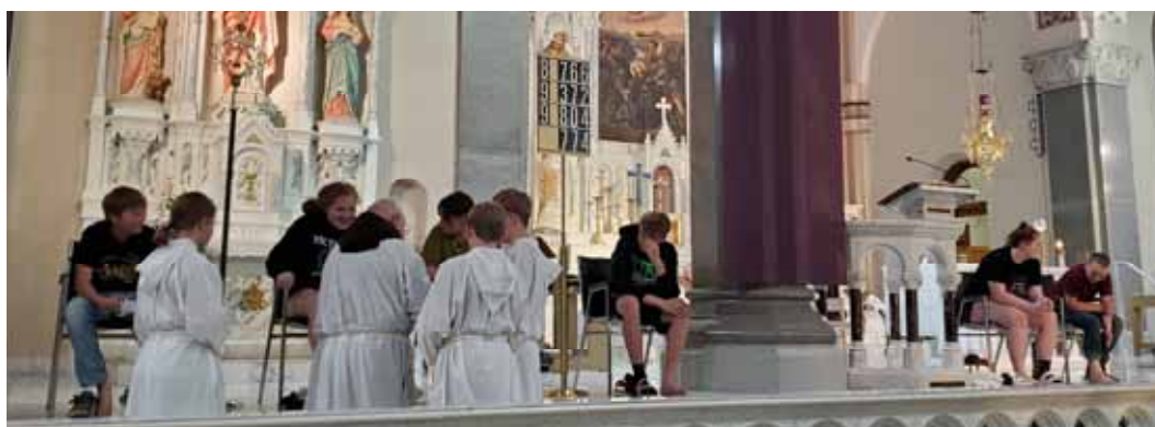
Jr. CYO retreat followed by Maundy Thursday service (washing of the feet— above)