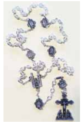
6mm Faceted Clear Glass Beads