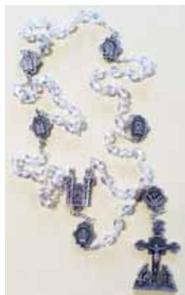
7mm Borealis Clear Glass Beads

If you view the bulletin on-line at StFidelisChurch.com , it is in color and you will be able to see the color differences of the beads.