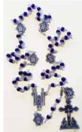
6mm Faceted Blue Glass Beads