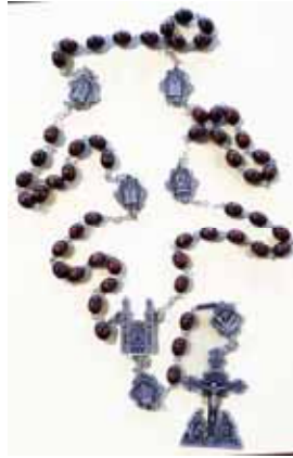
Dark Brown Oval Wood Beads