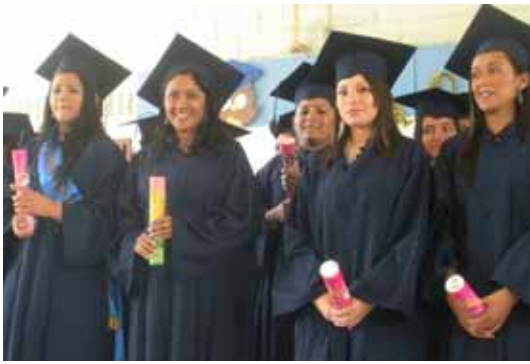
High School graduates who grew up at the COAR Children's Village in El Salvador.