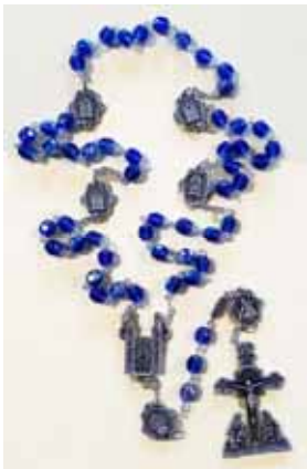
7mm Borealis Blue Glass Beads