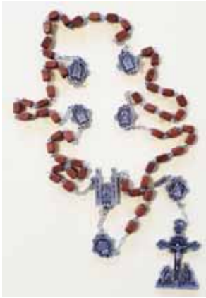
Light Brown Rectangular Wood Beads

They are available in the St. Fidelis Gift Shop located in the Parish Office at 601 10th Street.