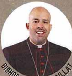
BISHOP JOSEPH ESPALLAT