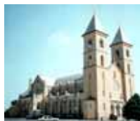
St. Fidelis Church

Thank you to the individuals and businesses who lend their support by volunteering or generously giving monetary donations to make this Easter Egg Hunt possible.